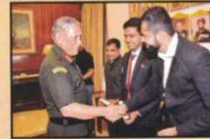
Interaction with General Bipin Rawat, Chief of Army Staff of the Indian Army