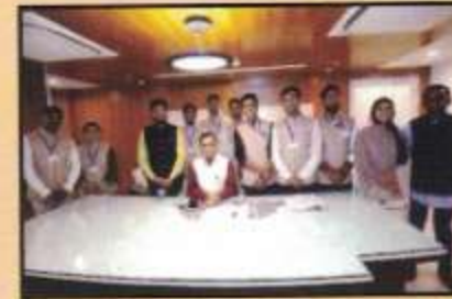
Interaction with Hon'ble Chief Minister of Gujarat Shri Vijay Rupani Ji during Vidhan Sabha Visit