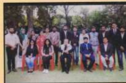
Interaction with Sh. Pranab Mukherjee, Hon'ble 13th President of India and senior leader, Indian National Congress