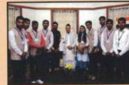
Interaction with Hon'ble Governor of Maharashtra Shri Bhagat Singh Koshiyari